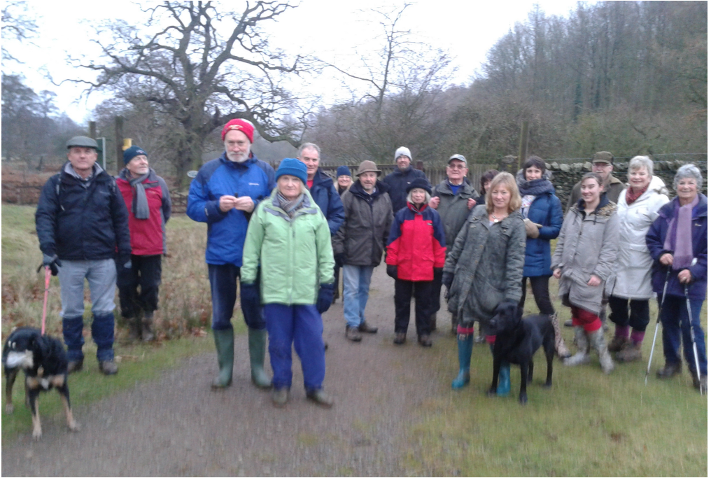
Ramblers arriving at the Park