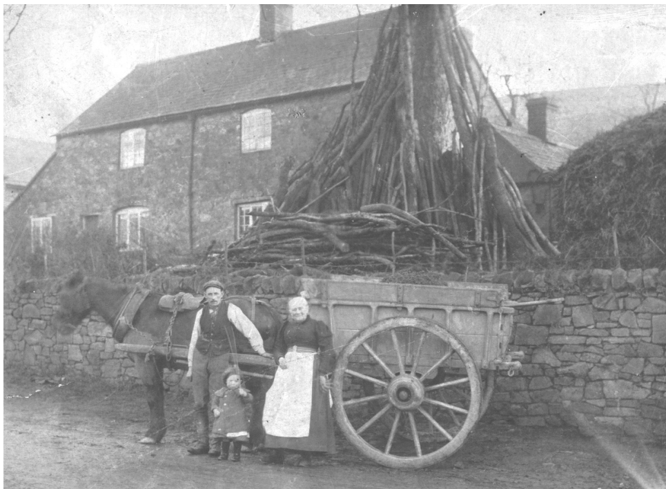
Wood Cart outside the Brewin's farmhouse - can anyone give us more details about it? From Pam McMorran

“Hold a Fish and Chip Supper to help spinal cord injured people live full and independent lives.”