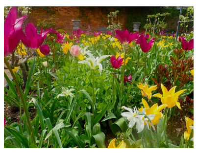
Tulip time at Westbrooke House

Bowden, LE16 8AX which opens on 28<sup>th</sup> April from 10-4.30pm. The walled garden features a wonderful show of over 10,000 tulips making a fantastic display. The spring garden features 'Sid the stag' with a woodland area to the front of the property which includes a large weeping willow and a river bridge leading to a folly. There is a slate water