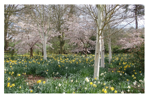
Himalayan white birch, blossom and spring bulbs at Stoke Albany garden

It is Tulip time at Westbrooke House, 52 Scotland Road, Little