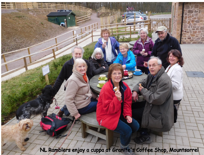
NL Ramblers enjoy a cuppa at Granite's Coffee Shop, Mountsorrel

Our walk continued through the castle gardens, the village green and along country lanes towards the recently built Mountsorrel Heritage Railway station platform on Bond Lane. From here it was a short walk to Nunckley Hill Station and Heritage Centre, built on the site of the old Nunckley Hill