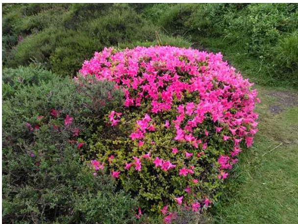
Rhododendron in Stoneywell garden

There were just six walkers on the June ramble. We took the footpath near the bottom of Markfield Lane and followed the Leicestershire Round as far as the footpath under the A50 near Markfield. We then turned right across the fields towards Stoneywell. Unfortunately at this point we had a short rain shower and had to put on our waterproofs.