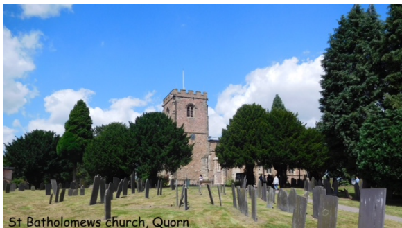
St Bartholomew's church, Quorn