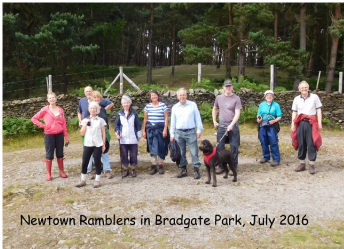
Newtown Ramblers in Bradgate Park, July 2016