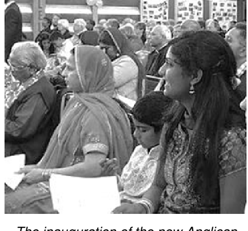
The inauguration of the new Anglican Church All Saints, on 11<sup>th</sup> June 2012